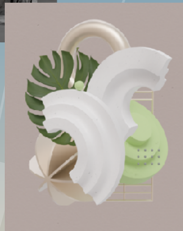
NFT Trophy 2021